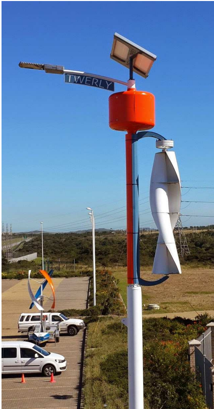
Twerly Street Light

Solar & wind powered off lighting solution with GSM connection for status info