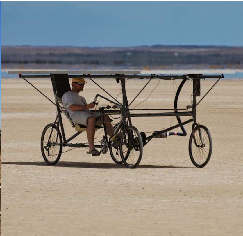
Gonzo (solar cart)

Solar only powered cart for personal transport